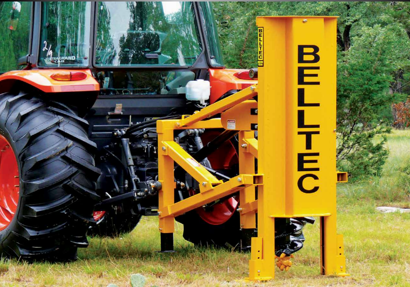
TM-48 BELLTEC DIGGER