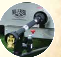
Available in PTO