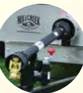
Available in PTO